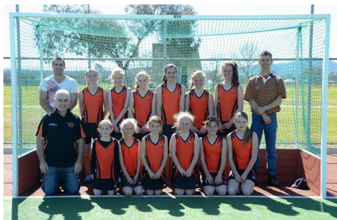
Table Top may be a small school but for the Under 12 Falcons hockey team they are major players. The team of 11 includes 5 Table Top school girls - nearly half the team. The coach (Emmo) is also a Table Top parent. The Falcons Hockey Club haven't had an U12 Girls team in finals for over 10 years.

These girls, their families and friends are beautifully representing themselves, Table Top School and the local area. It was obvious last Saturday how positive and motivated the families were in supporting the girls and the team, the umpires decisions and the opposition as well.