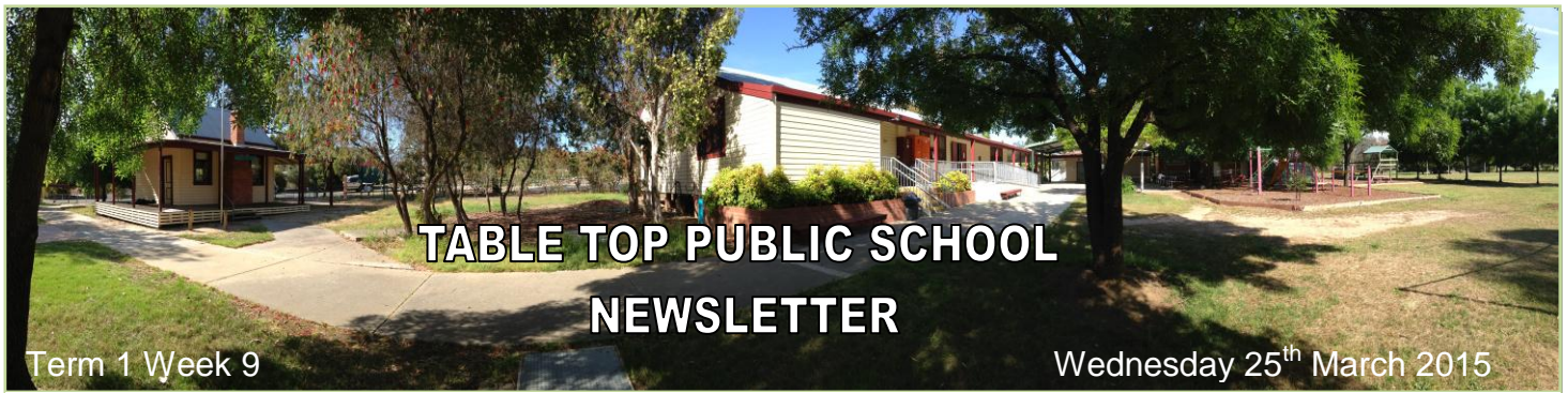
TABLE TOP PUBLIC SCHOOL NEWSLETTER